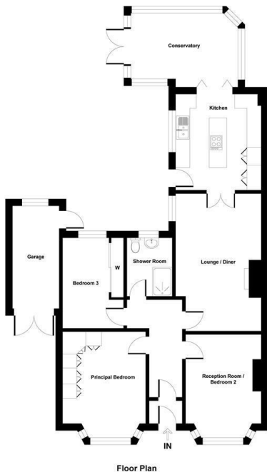
Illustration for identification purpose only, measurements approximate and not to scale, unauthorized reproduction is prohibited. All rights reserved for Alexander Hudson Estates